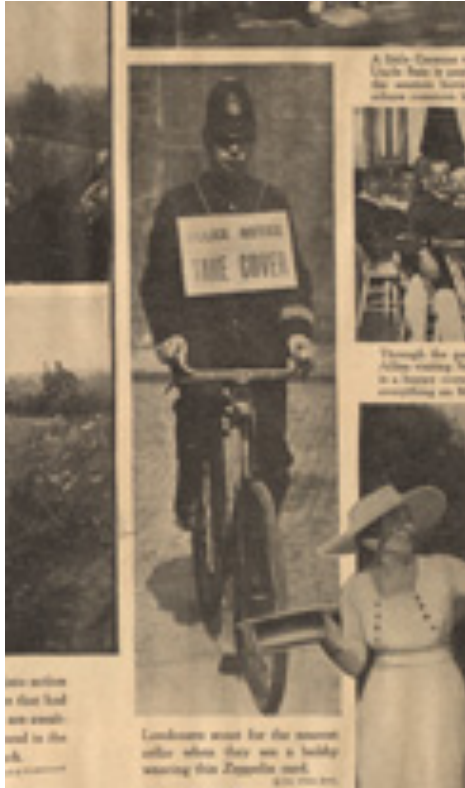
Figure 1. Newspaper using Rotogravure process. “Londoners scoot for the nearest cellar when they see a bobby wearing this Zeppelin card.” ( New York Tribune , August 12, 1917)

http://memory.loc.gov/ammem/collections/rotogravures/