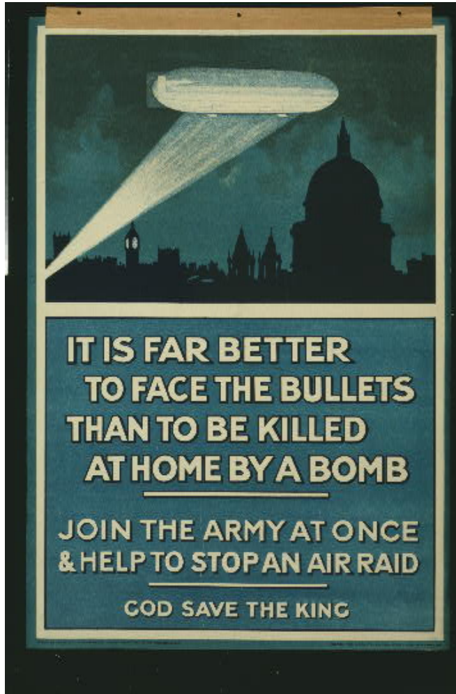
Figure 2. World War I Propaganda poster. Recruiting based on fear of aerial warfare. http://loc.gov/pictures/resource/cph.3g10972/

By 1912, the use of dirigibles and aircraft were seriously considered by military authorities and was reflected in exercises using these weapons of war. One British newspaper, National Review , carried an article written by a member of the British Parliament (E. Joynson Hicks) titled, “Command of the Air.” The article boldly stated that, “It is now known that bombs and bullets can be discharged from aeroplanes over hostile armies with considerable effect—quite sufficient to expedite a retreat...” (Kennett, 1991, p. 43). Some of this thought may have been related to the mysticism of a military strike from the air. Figure 3 shows a “God punish