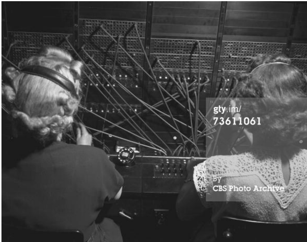
View of two operators and their switchboard at CBS studios, May 31, 1949.