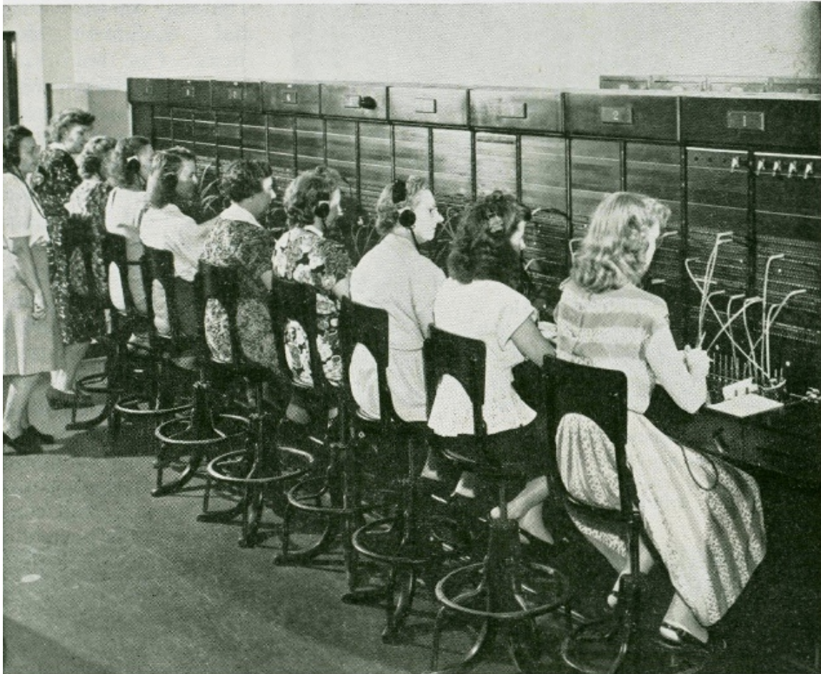
View of an eight station PBX switchboard, company unknown.